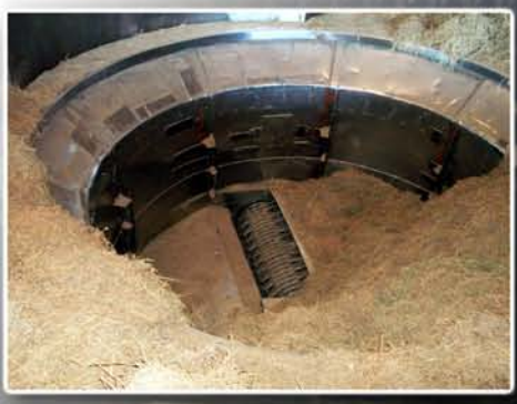
Hammer Mill / Rotor Repair & Balancing

Other options include both Robot & Hand Applied High Performance Wear Resistant Materials. Give us a call for more information about NitroGrit™ and the other wear resistant materials available for your forage hammer mill grinder.